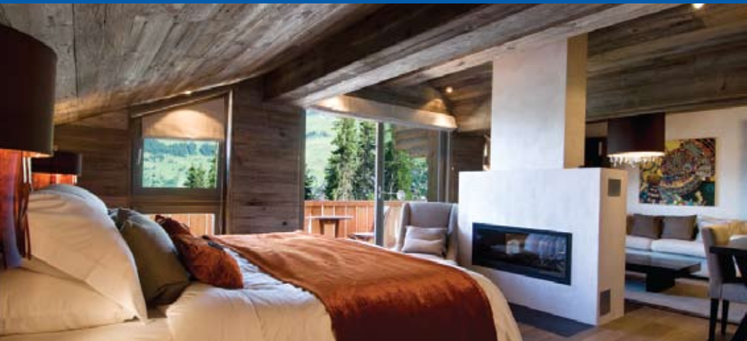
SUITES FOR MY SWEET