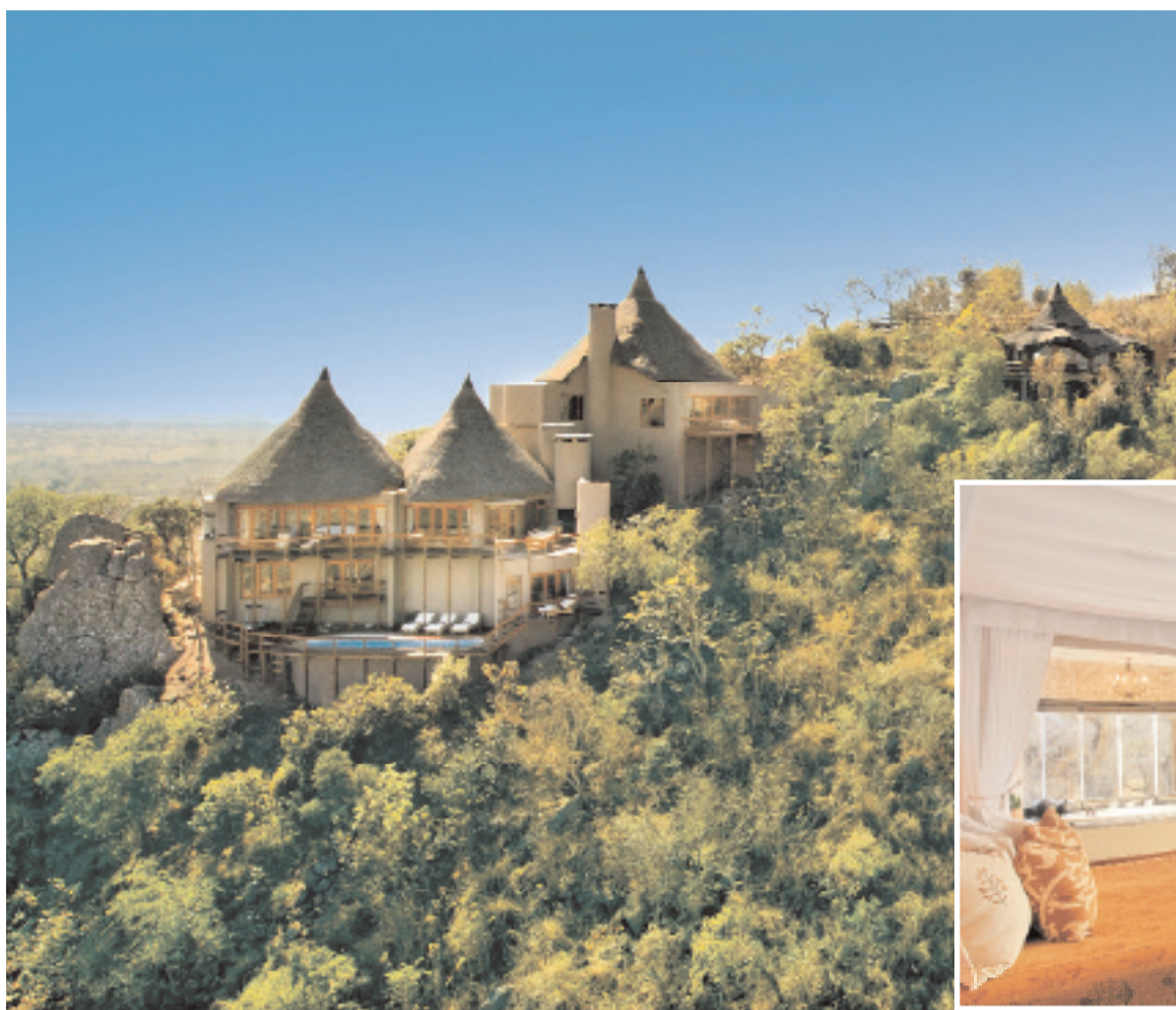
The accommodation and wildlife at Ulusaba are each as captivating as the other.