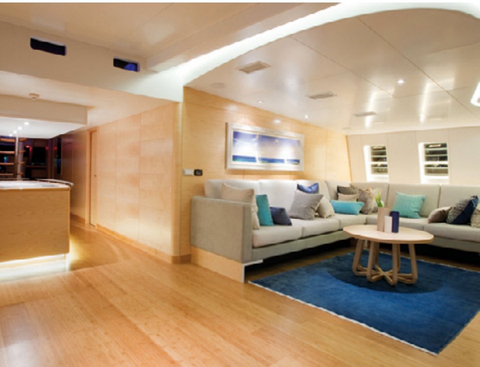
Above: Necker Belle's saloon converts into a double cabin with a privacy screen Opposite page, from top: Ulusaba in South Africa; cabin luxury on board Necker Belle; Sa Terra Rotja in Mallorca; The Lodge, Verbier